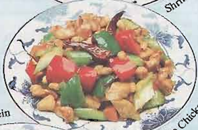
Kung Pao Chicken