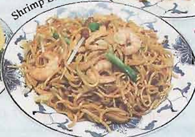
Shrimp Lo Mein